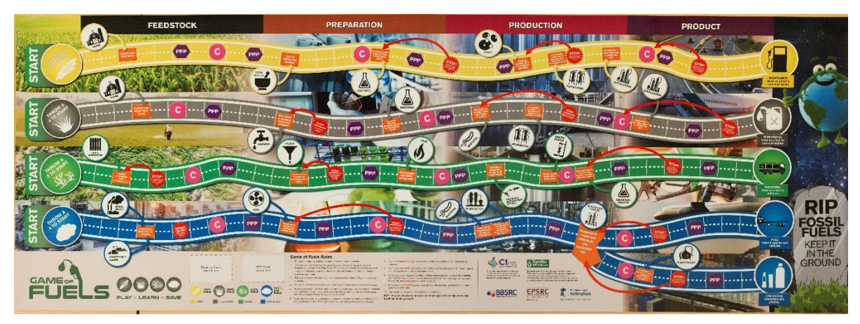
Final version of the Game of Fuels printed onto vinyl material

The final copy of the game was printed on durable vinyl material measuring width: 60cm and length: 170cm.