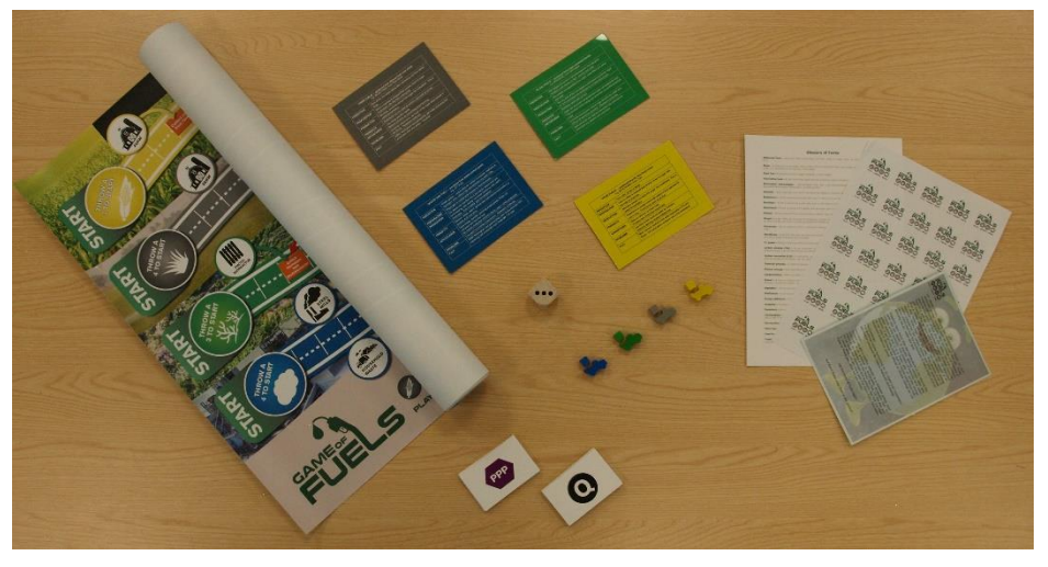
Game of Fuels materials