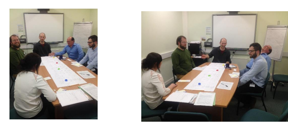
One of the focus groups playing the draft version of the game and generating discussion